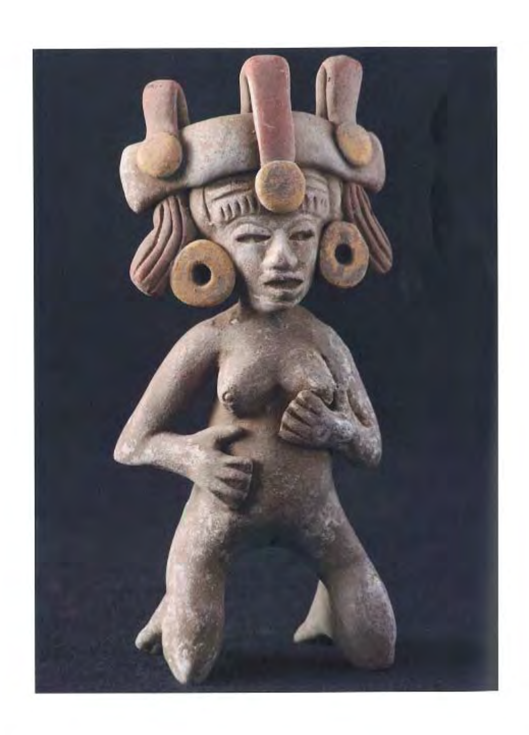
MESOAMERICA: Female Figure from Teotihuacán, Mexico. terracotta