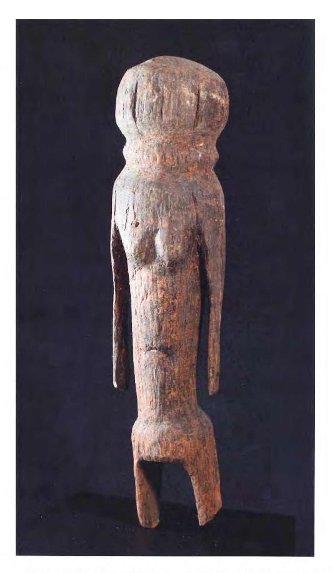
AFRICA: Moba Divinity Figure, Togo tribe, Ghana. wood