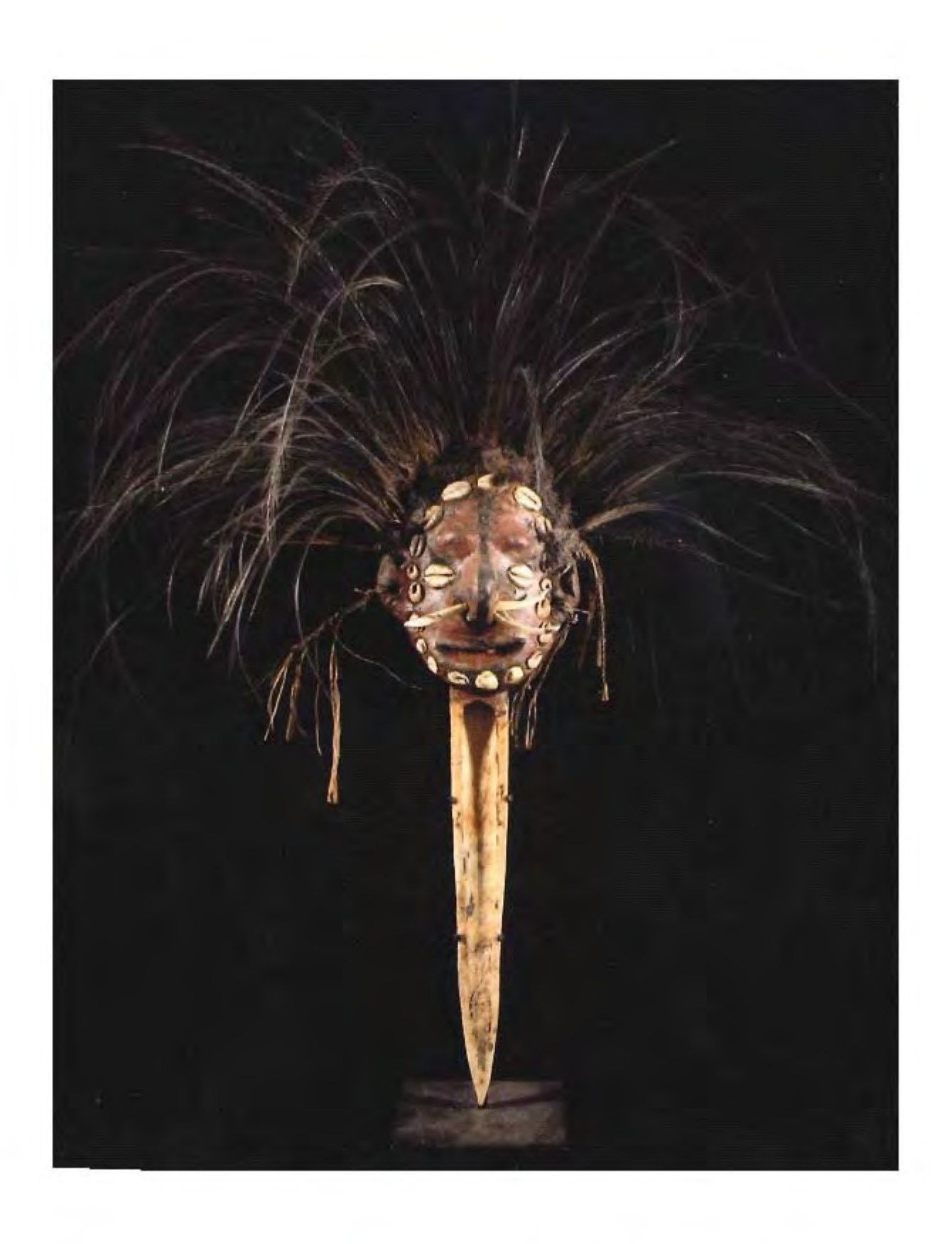
OCEANIA: Payback Dagger, latmul tribe, Papua New Guinea. mixed media