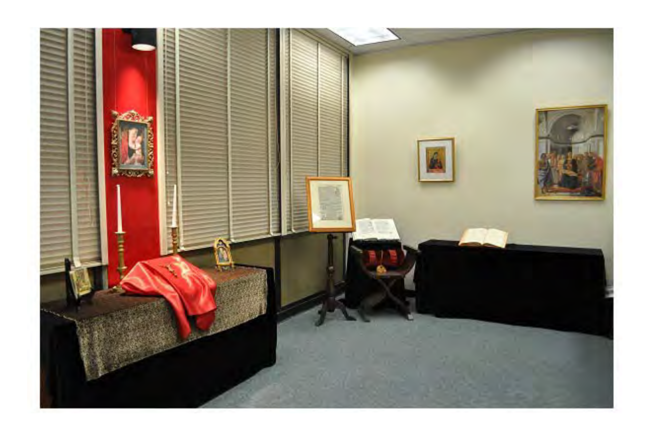
EARLY RENAISSANCE WALLS with books illustrated by Durer and Botticelli