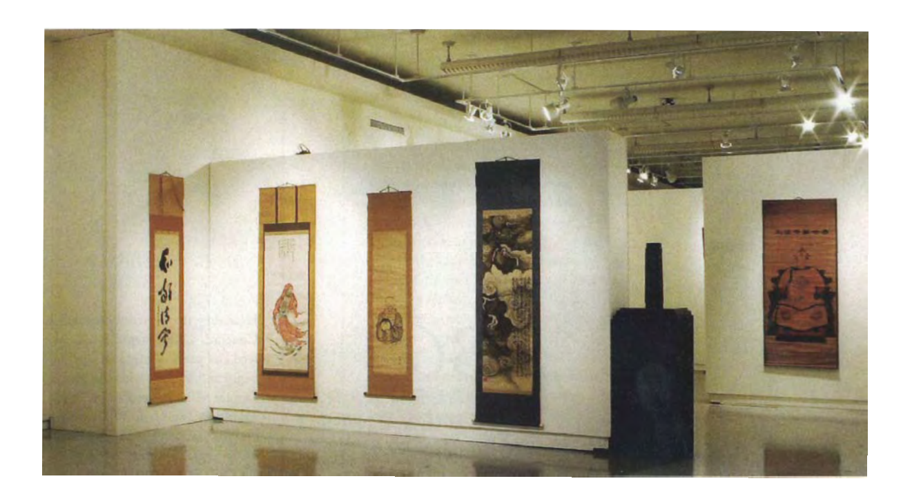
JAPAN & CHINA: Hanging Scrolls. ink on paper