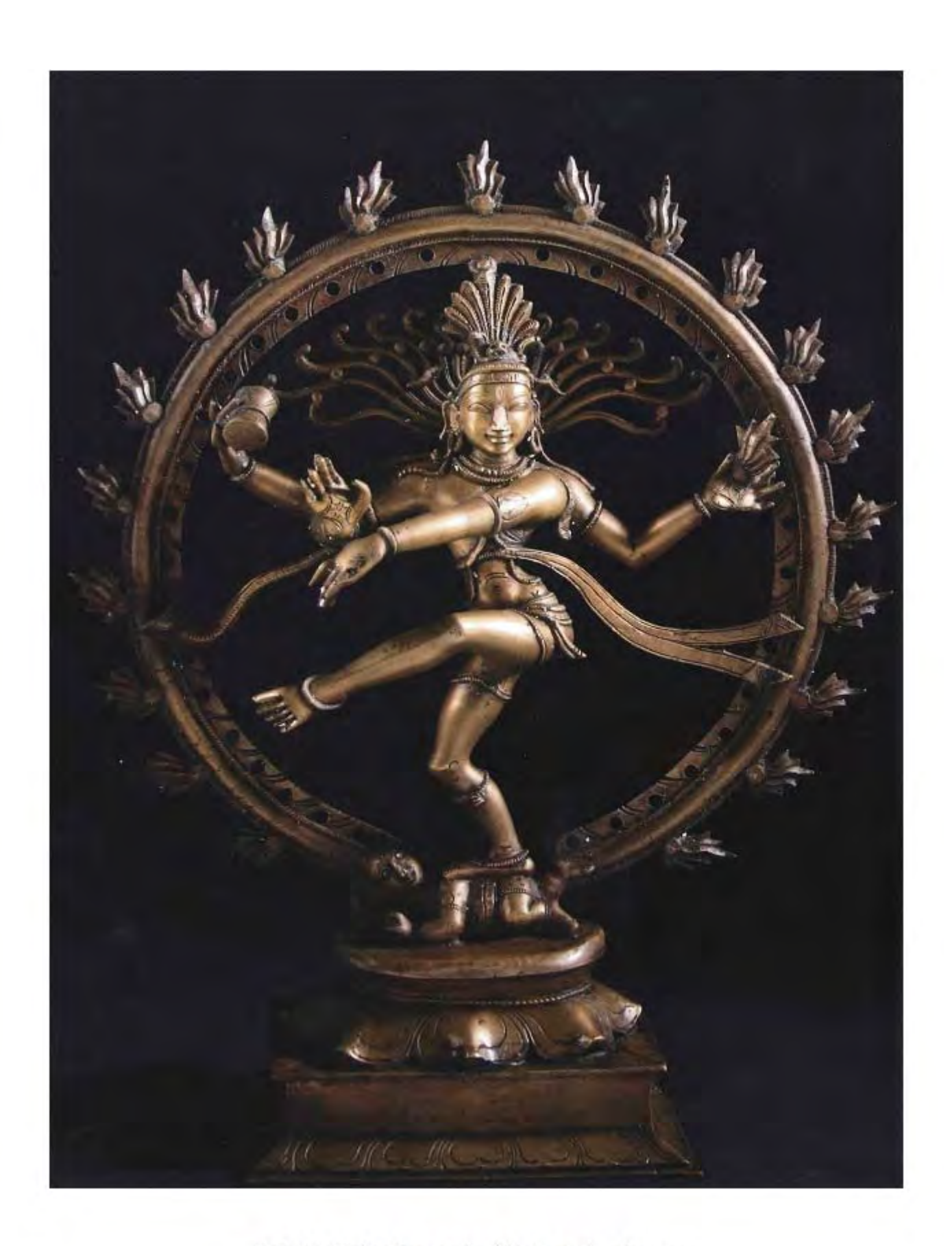
INDIA: Shiva Nataraja, Chola style. bronze